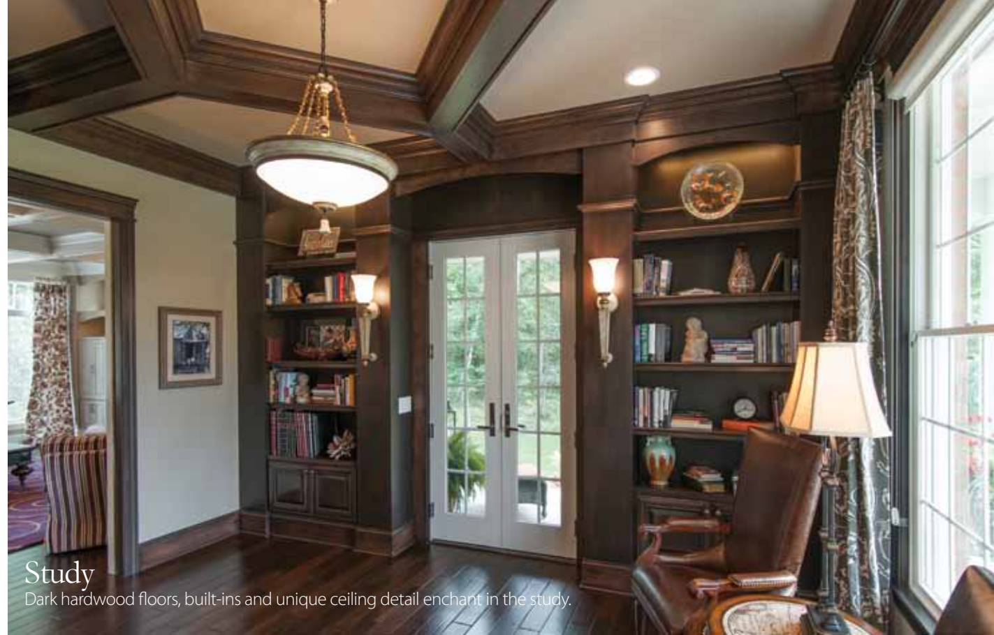
Study Dark hardwood floors, built-ins and unique ceiling detail enchant in the study.