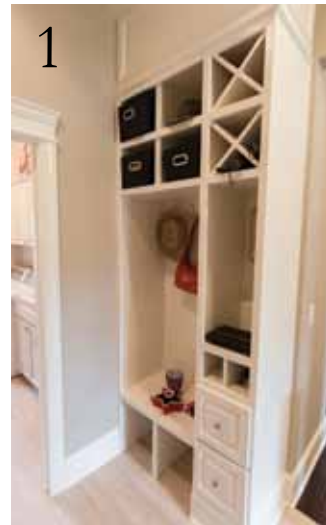
1 | Mud Room This cozy nook, located off the garage entrance, is perfect for storing personal belongings.