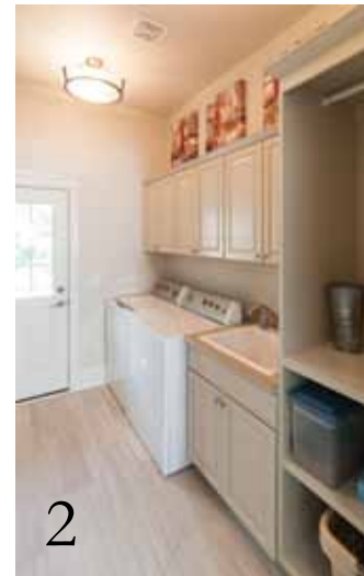
2 | Laundry Room A spacious area with ample storage makes washing clothes less of a chore.