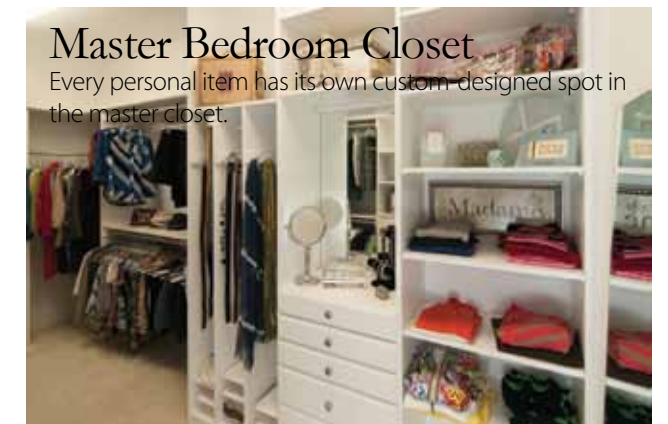
Master Bedroom Closet Every personal item has its own custom-designed spot in the master closet.