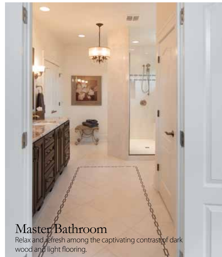
Master Bathroom Relax and refresh among the captivating contrast of dark wood and light flooring.