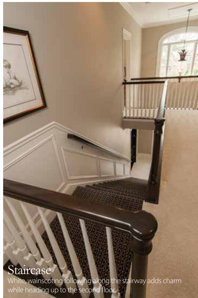
Staircase White, wainscoting following along the stairway adds charm while heading up to the second floor.