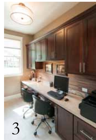
3 | Office A stylish spot to start and finish work.