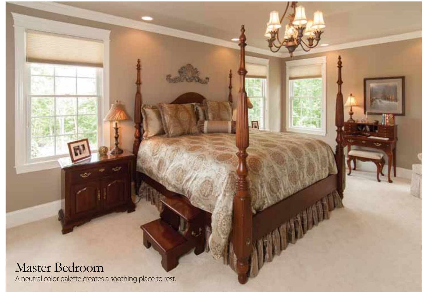
Master Bedroom A neutral color palette creates a soothing place to rest.